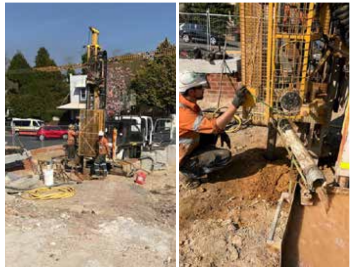
Preparations for the new club began with soil samples being taken on the site